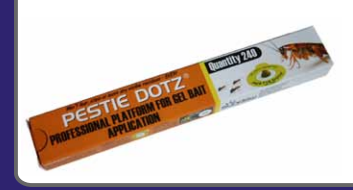
PestieDOTZ<sup>®</sup> Professional Polymer Platform for Gel Baiting

Pack Sizes Available: 240 Dotz per pack Market Segments: For use with cockroach bait gels.